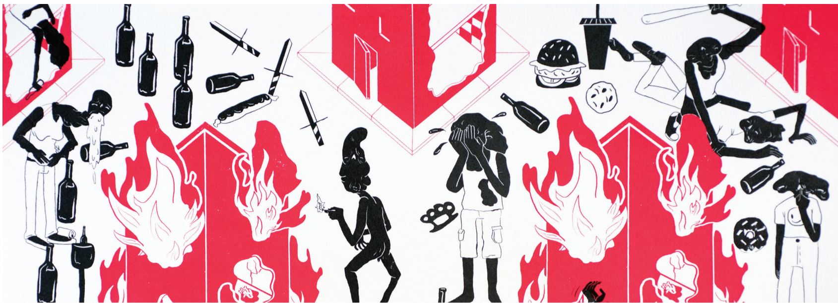
GALLERY 1 & 2