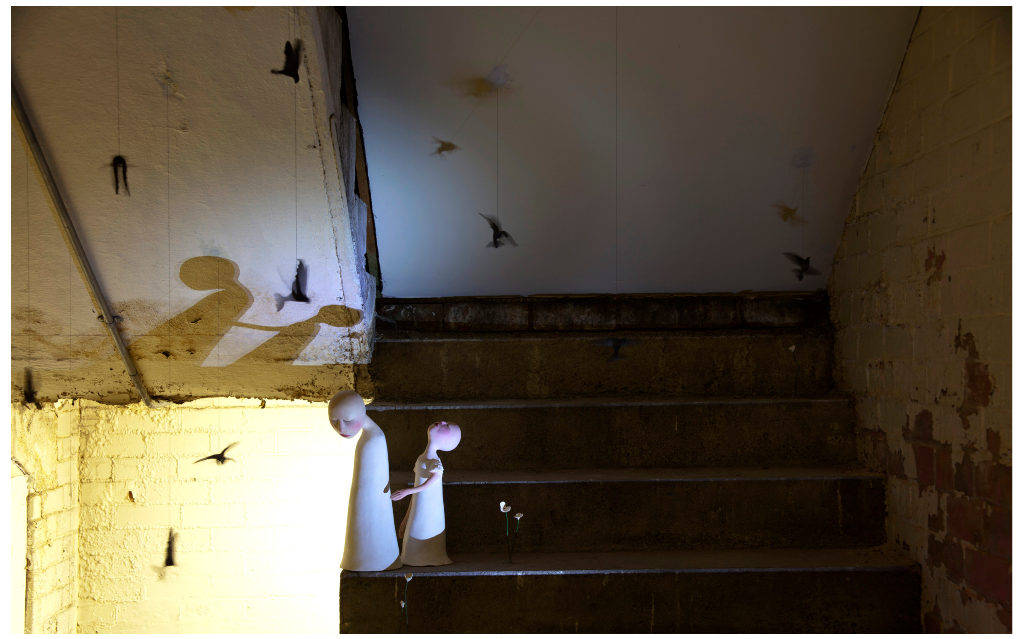
'Wane', Gallery Installation, Mairead Dunne