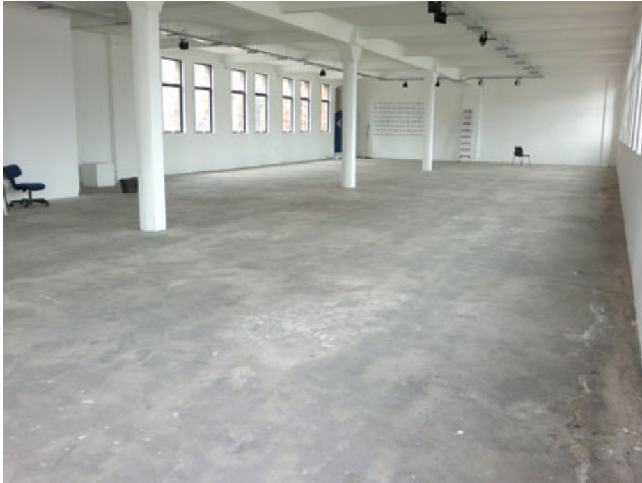
Appendix 3: Picture of main Gallery from back